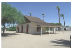
Sahuaro Ranch Adobe House

Your society's docents conduct tours October to May: noon to 4 pm (last tour starts at 3 pm). Fees: Adults $5, Seniors $4, Ages 6-16 $1, GAHS MEMBERS are FREE. These tours are on the 1 st and 3 rd Saturday of each month during tour season. This season's final tour is on Saturday, May 4, 2019. Thanks to those of you who joined us for these amazing ranch tours.