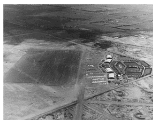
Thunderbird Field 1941