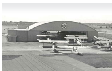
Historic Hangar 1941