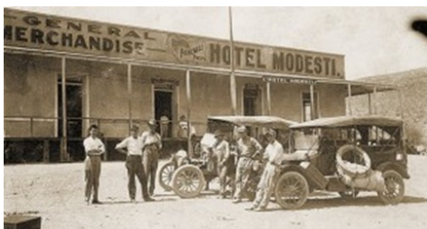
Hotel Modesti at Agua Caliente hot springs