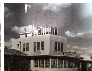
Air Control Tower 1941