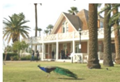
Sahuaro Ranch Guest House