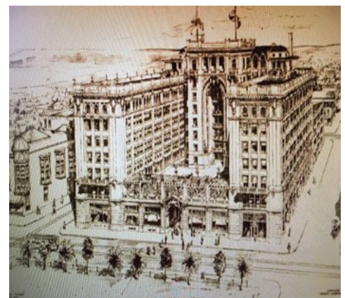
U. S. Grant Hotel (1906) San Diego, CA