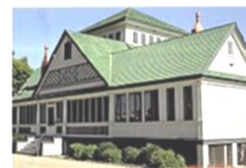
Manistee Ranch House