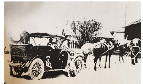
2 teams pulling the Hudson to Glamus, CA