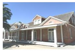
Sahuaro Ranch Main House