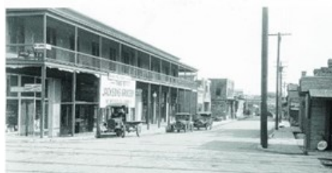
Hotel Gandolfo at Yuma